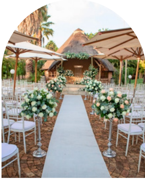
Big Hall / Middle Hall Additional R4000