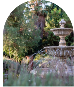
Rustic Hall Additional R4000