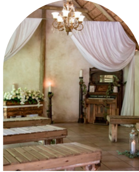
Rustic Hall Lapa Chapel Included