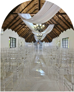
Big Hall / Middle Hall Chapel Included